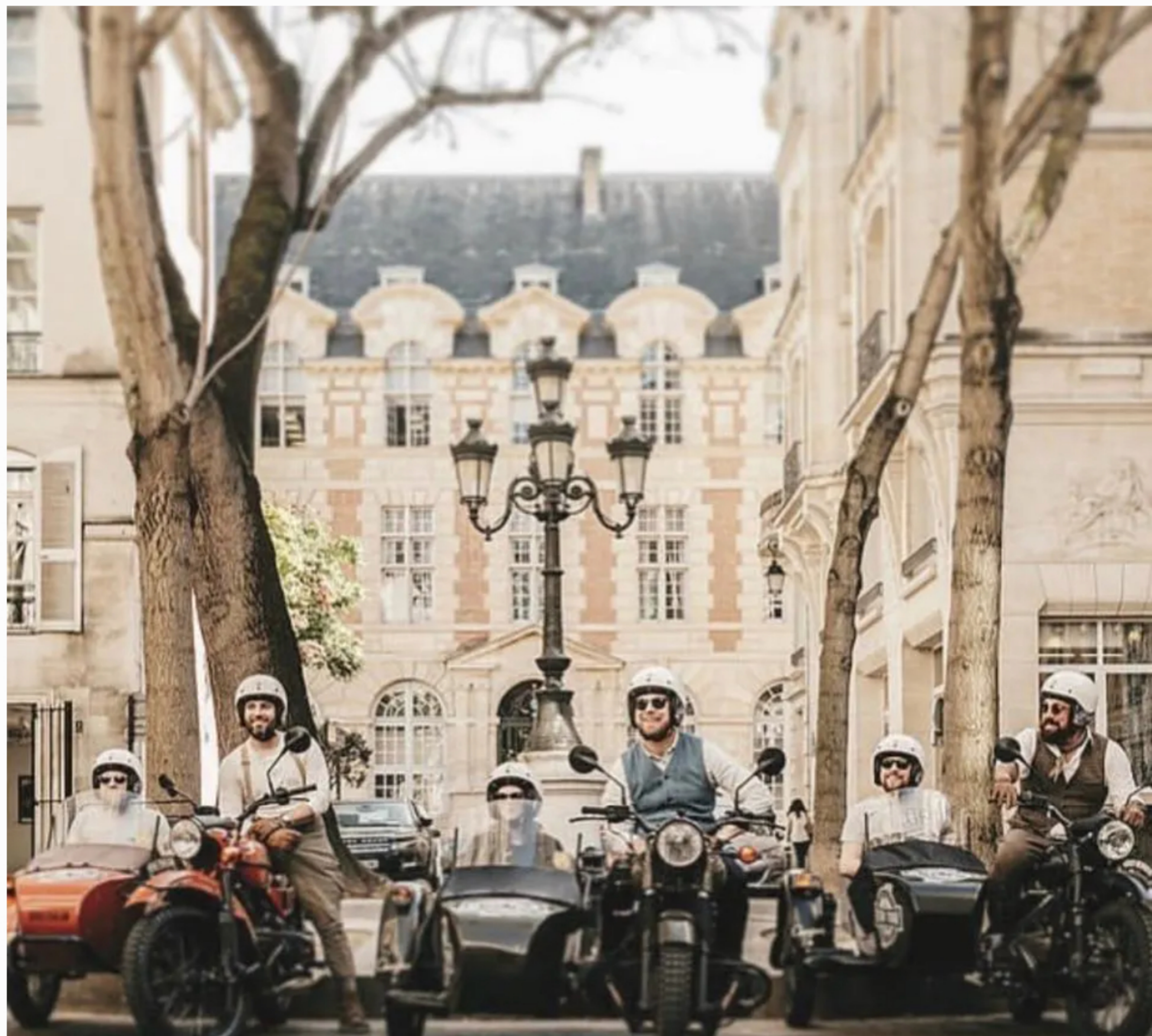
Sidecar tours in Montmartre SACREBLEU PARIS

I often try local travel companies when I'm in Paris who arrange guided tours of museums and other excursions, but on my most recent trip in the fall, I had the pleasure of using the best one yet: Sacrebleu Paris .